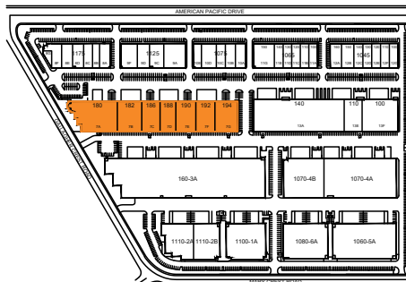
BUILDING KEY PLAN: