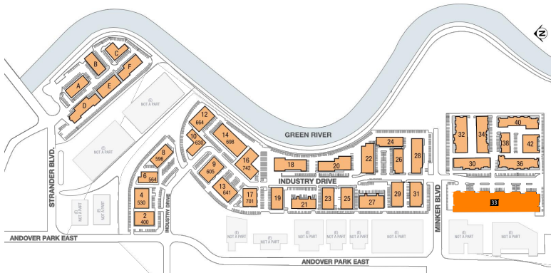
SITE PLAN KEY: